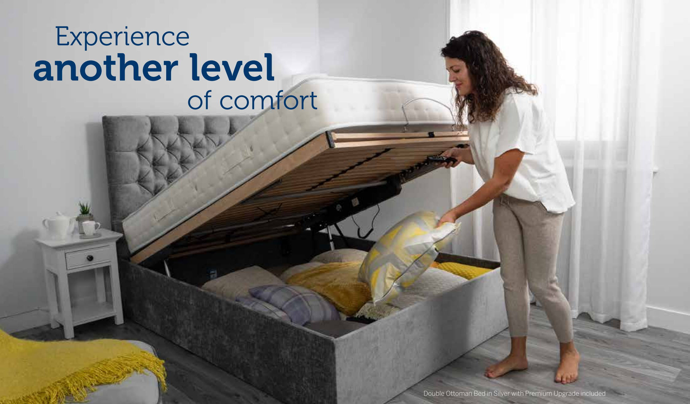
Double Ottoman Bed in Silver with Premium Upgrade included