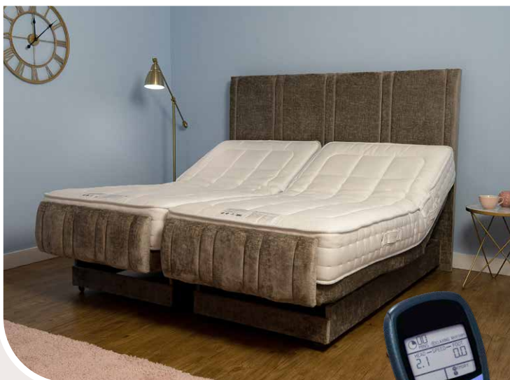
Ergonomic hand controls with memory settings