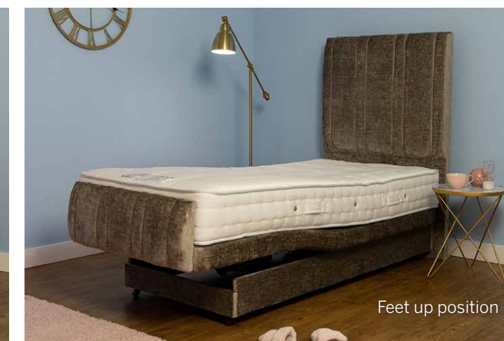
Feet up position

For a free no-obligation home demonstration, call free on 0800 689 6891 or visit adjustamatic.co.uk