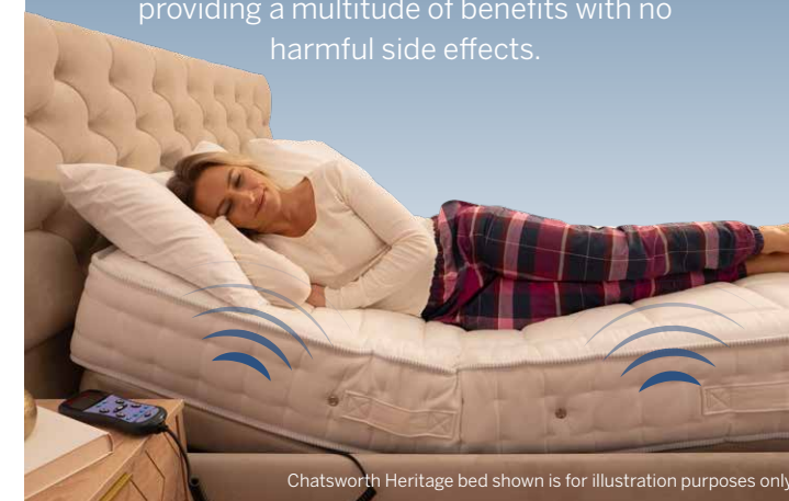
Chatsworth Heritage bed shown is for illustration purposes only.

The result is a deep penetrating therapy, providing a multitude of benefits with no harmful side effects.