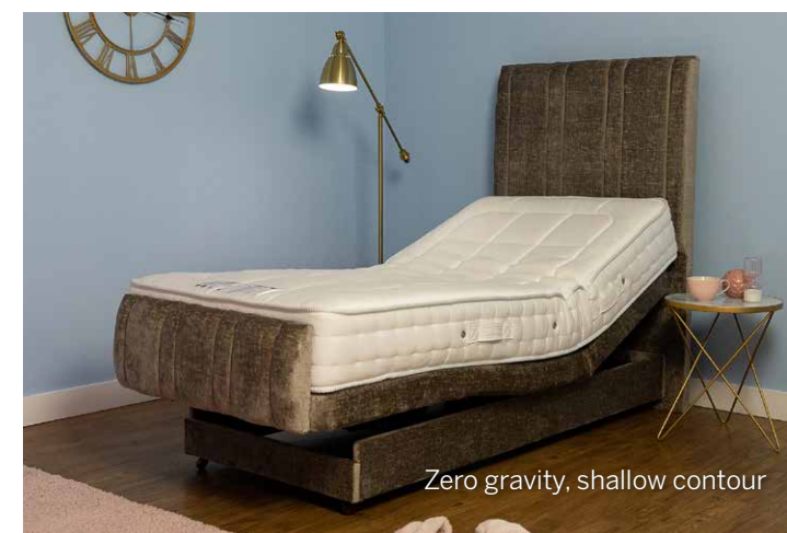
Zero gravity, shallow contour